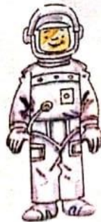
a s t r o n aut