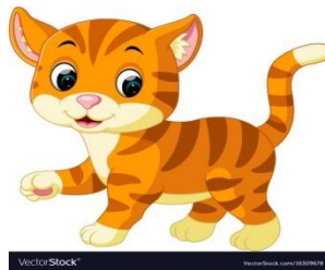
VectorStock shutterstock.com/6029993 Tom