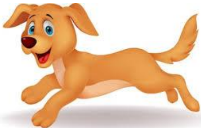
Bingo