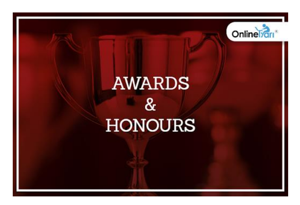
Lesson 12: National Awards and Honours

Awards are given to recognize an achievement, a victory or any great act that is praise worthy. The very essence of giving an award is to recognize the expertise and outstanding achievement in a particular field. Awards can also encourage people to do better and they can serve as a form of motivation.